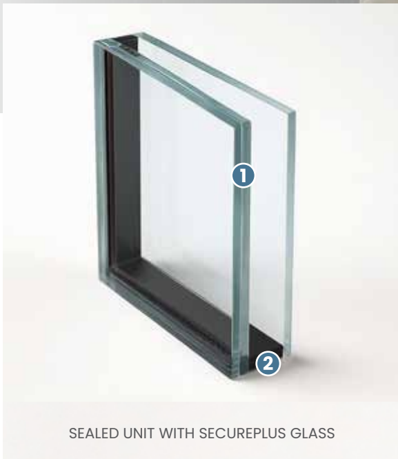
SEALED UNIT WITH SECUREPLUS GLASS